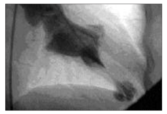
Figure 1. Severe mid-ventricular hypertrophy with hourglass appearance at systole during left ventriculography

A 54-year-old female patient was admitted to our clinic with the complaints of palpitation, dizziness, chest pain and dyspnea on exertion. Blood pressure was 100/60 mmHg, pulse 104 beats/min. An early systolic sound and third degree systolic murmur in mitral area radiating to mid-clavicular line were heard at cardiac auscultation. Other system examinations were normal. On electrocardiogram, downsloping type ST depression with negative T waves in precordial derivations and right bundle branch block were seen. Telecardiography showed neither cardiomegaly nor pulmonary congestion. Mitral insufficiency (central, jet second degree) and concentric left ventricular (LV) hypertrophy had been reported in the former echocardiography report. Coronary angiography and left ventriculography were done. Coronary angiograms showed no narrowing of major epicardial coronary arteries. Severe mid-ventricular hypertrophy with hourglass appearance at systole and apical aneurysm were detected by left ventriculography (Figure 1). Left ventricular catheterization revealed normal cardiac output and severe intra-ventricular pressure gradient (95 mmHg at rest) between the LV apical and basal chambers. A new echocardiographic examination was