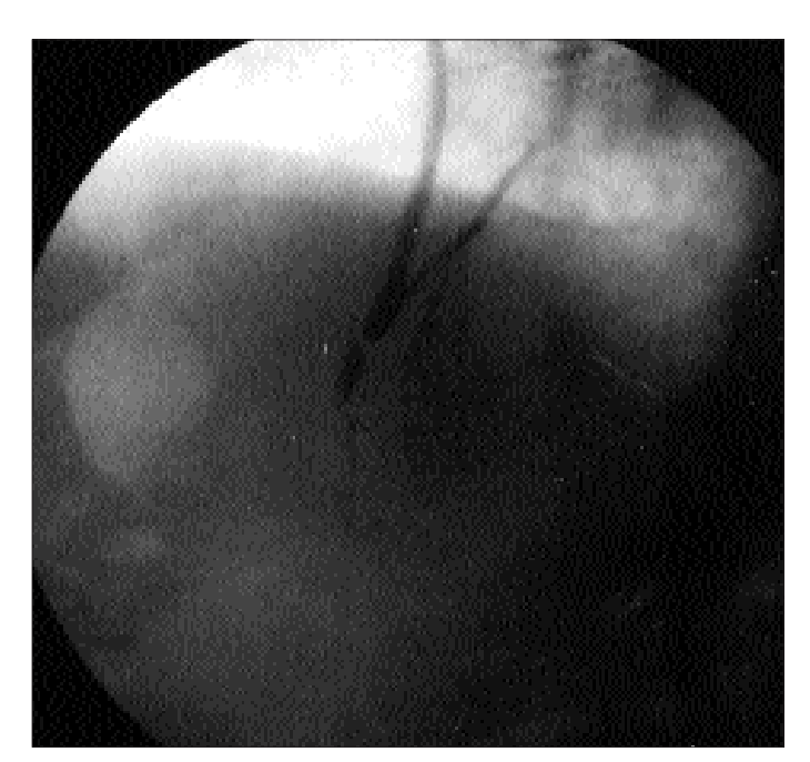
Figure 2. Angiographic assessment for graft patency. Distal portion of the left descending coronary artery is occluded but vein graft is seen to be filled form the proximal portion of the left descending coronary artery retrogradely