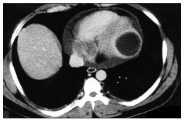
Figure 1. Computerized tomography view of left ventricular cardiac hydatid cyst

A 37-year-old male butcher patient was admitted to the hospital with chest pain and productive cough. The patient electrocardiography was imitating inferior myocardial infarction signs (T - wave (-), and pathologic Q on derivations D2-3, aVF). Laboratory tests were normal except C-reactive protein (++) and high sedimentation ratio (100mm/h). The patient was evaluated for his chest pain and underwent coronary angiography, which was normal. Computerized tomography of the thorax confirmed the diagnosis of cystic lesion with normal lung parenchyma (Fig. 1). On cardiac magnetic resonance imaging, the lesion appeared to be