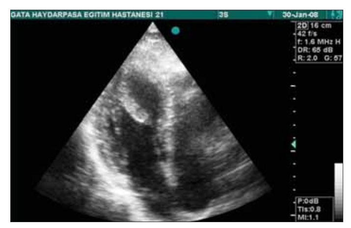
Figure 2. Two-dimensional echocardiographic apical 4-chamber view of the left ventricle with hypertrophic papillary muscle (dimension 25x12 mm)

muscle hypertrophy, which had been defined as diameter of at least one papillary muscle more than 1.1 cm. It is suggested that this entity is a subtype of hypertrophic cardiomyopathy.