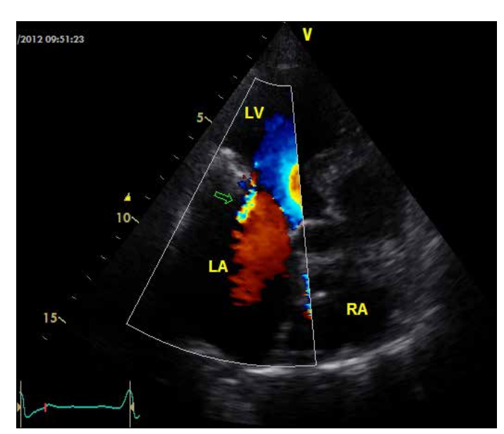
Figure 3. View of mild mitral regurgitation after a dual-chamber pacemaker placement (arrow)

Anadolu Kardiyol Derg E-sayfa Özgün Görüntüler E-jage Original Images E-j