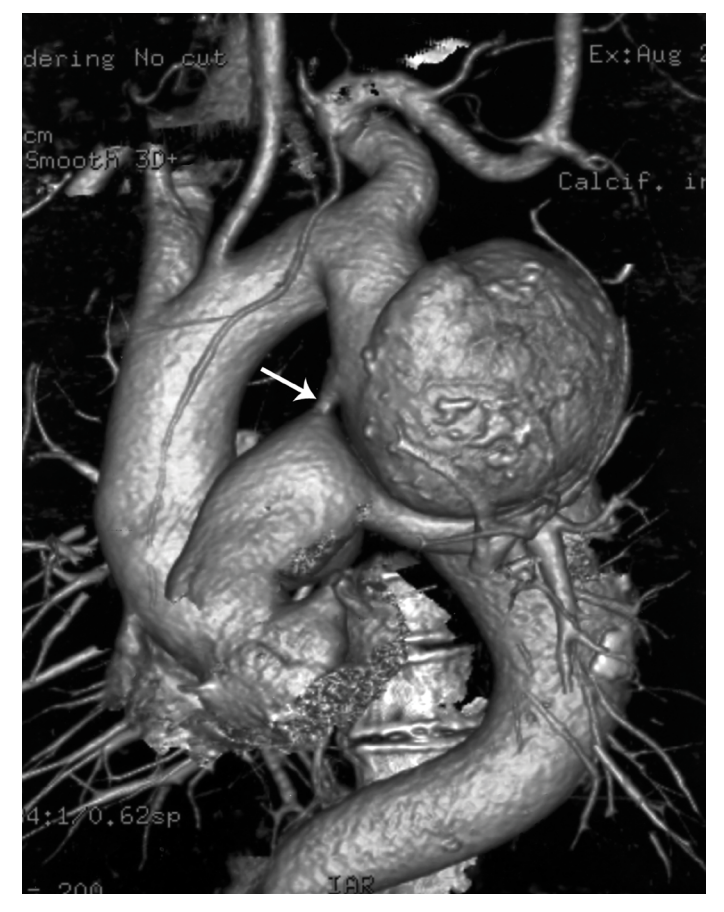
Figure 1. Diagnostic angio-CT. A large saccular aneurysm of the thoracic aorta and PDA can be observed. The distal thoracic aorta is also enlarged

Aortic coarctation may occasionally be associated with a second congenital disease, such as patent ductus arteriosus (PDA) (1). When diseases coexist in children or teenagers, surgical treatment is frequently recommended as far as both conditions can be addressed in a single surgery. Depending on the techniques used during the initial surgery, late complications after surgery for aortic coarctation may be the formation of an aneurysm in the descending aorta (2). Reopening of PDA has also been observed after sur-