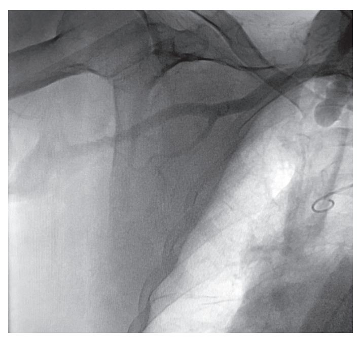
Figure 4. Right subclavian angiography revealing no sign of contrast blush of a possible perforation

through the axillary artery to the aortic arch was achieved by changing to 0.035 inch stiffer hydrophilic wire. The patient complained of a dull right-sided chest pain 2 h after the procedure. There was no coronary ischemia visible on ECG, but ecchymotic tender swelling was noted on the right pectoral region (Fig. 3a). Thorax CT revealed a right pectoral muscle hematoma (Fig. 3b). His axillary and subclavian angiography revealed no extravasation (Fig. 4). Both patients were followed up with cold press and firm bandage over the hematoma.