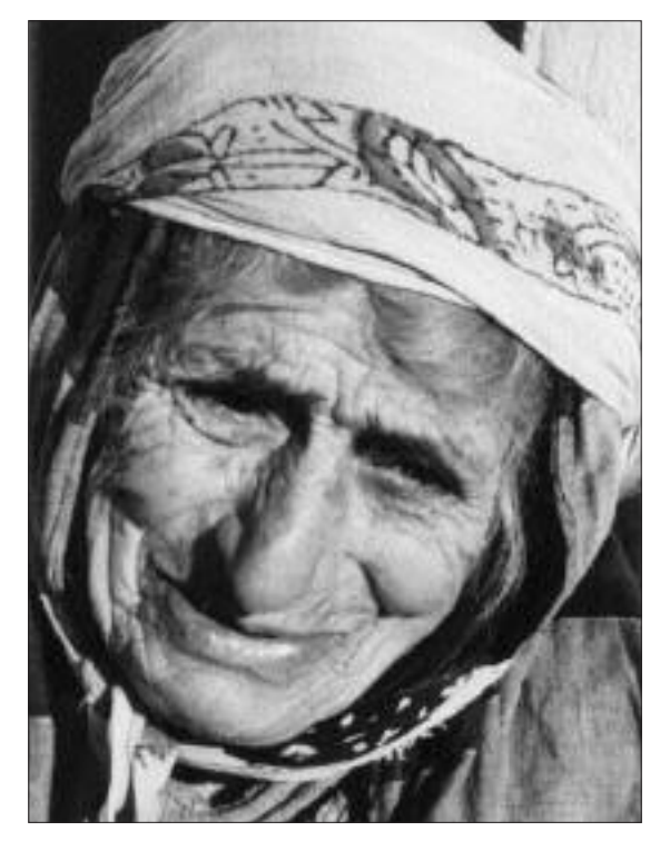
Hamsiköy'den (Trabzon) bir nine (1964).