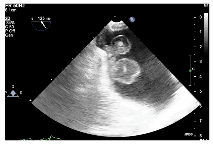
Figure 2. TEE showed two large cystic masses with bright centers and thin echogenic margins (20\times16 \text{ mm}; 12\times12 \text{ mm}) on the RA wall and at the IVC entrance, which suggests RA-free wall abscesses

\label{temperature} \textbf{TEE-transesophageal echocardiography, RA-right atrial, IVC-inferior vena\ cava}