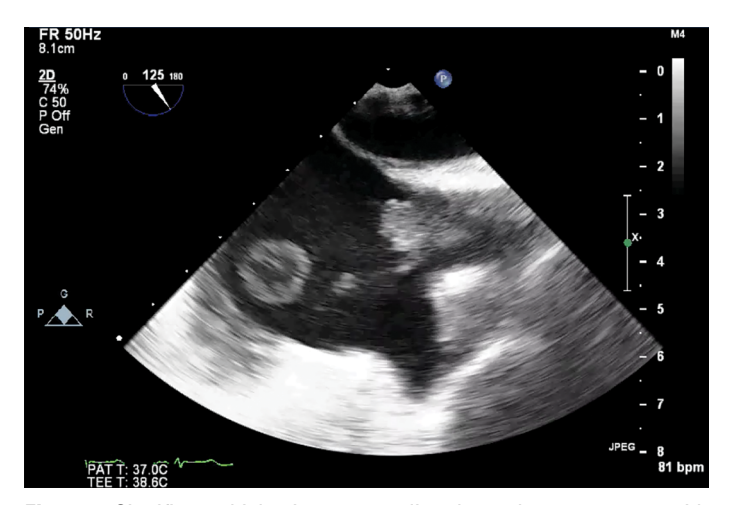
Figure 1. Significant thickening surrounding the catheter entrance with multiple vegetations, including a large, mobile one (24×15) attached to the catheter tip as revealed by transesophageal echocardiography

Surprisingly, TEE revealed multiple vegetations, including a large mobile one (24×15 mm), attached to the catheter tip (Fig. 1,