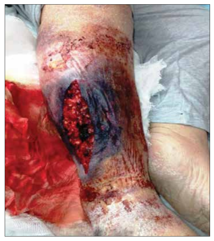
Figure 2. A photograph of the large hematoma after linear incision for drainage