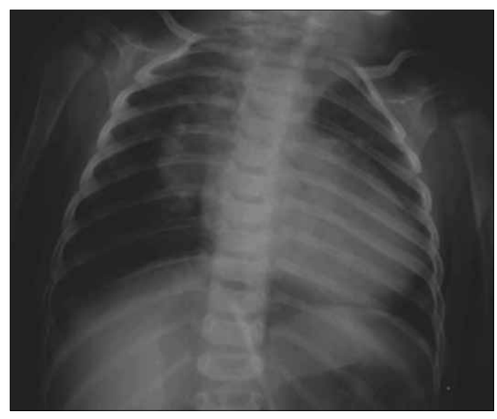
Figure 1. Chest radiography shows well delineated huge mass on the upper and middle part of the right lung due to enlarged right pulmonary artery

Tetralogy of Fallot with absent pulmonary valve syndrome is a rare variant of tetralogy of Fallot. It may clinically be present with airway compression from dilated pulmonary arteries or congestive heart fail-