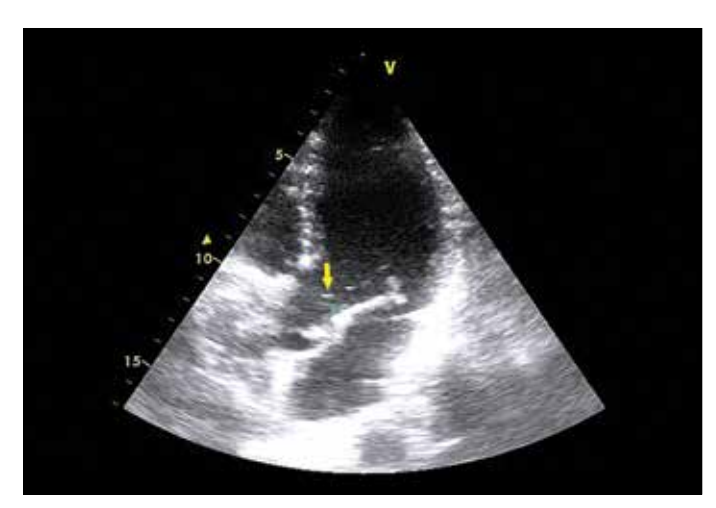
Figure 3. Transthoracic echocardiography (apical 5-chamber view) demonstrates an elongated anterior mitral chordae tendineae protruding into the left ventricular outflow tract (arrow)

Anatol J Cardiol 2015; 15: E13-6 E-page Original Images E-15