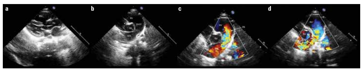
Figure 2. a-d. Two-dimensional echocardiography shows malalignment ventricular septal defect, dextroposition of the aorta, dilatation of main pulmonary artery and right pulmonary artery but not of the left pulmonary artery (a, b). Color Doppler echocardiography shows turbulent flow across the right ventricular outflow tract and large regurgitation belonging to pulmonary insufficiency (c, d)

Ao - aorta; asterisk - indicates dextroposition of the aorta; LV - left ventricle; MPA - main pulmonary artery; PR - pulmonary regurgitation; RPA - right pulmonary artery; RV - right ventricle; and RVOT - right ventricular outflow tract