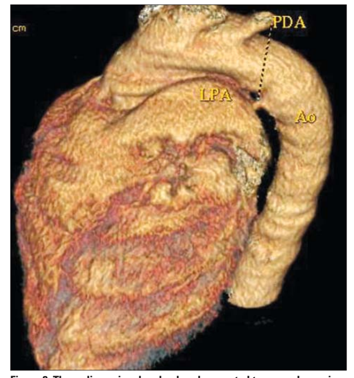
Figure 3. Three-dimensional and colored computed tomography angiography view of the PDA (arrow).

In conclusion, the asymptomatic PDAs are often small and they can be inadvertently missed unless special attention is directed to this region during routine examination or evaluation for other cause.