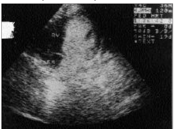
Figure 2: Bedside contrast echocardiographic image: Contrast media injected from the left central venous catheter soon appeared like a cloud in the left atrium and left ventricle.

LA: Left atrium, LV: Left ventricle, M: Mitral valve, RA: Right atrium, LV: Left ventricle, T: Tricuspid valve.