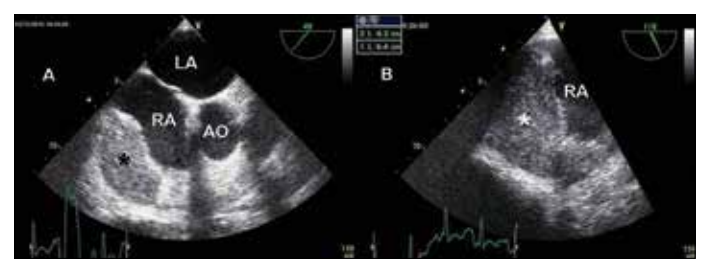
Figure 2. Transesophageal echocardiography shows the mass (black and white asterisk) with a greater size, attached to the lateral wall of the right atrium extending along both superior and inferior vena cava wall in the short axis (A) and modified bicaval view (B) Ao - aorta, LA - left atrium, RA - right atrium

IVC - inferior vena cava, PE - pericardial effusion, RA - right atrium, RV - right ventricle