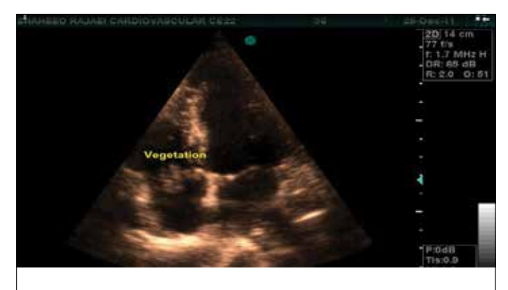
Figure 1. A large mass on the anterior leaflet of the tricuspid valve without evidence of a crista terminalis