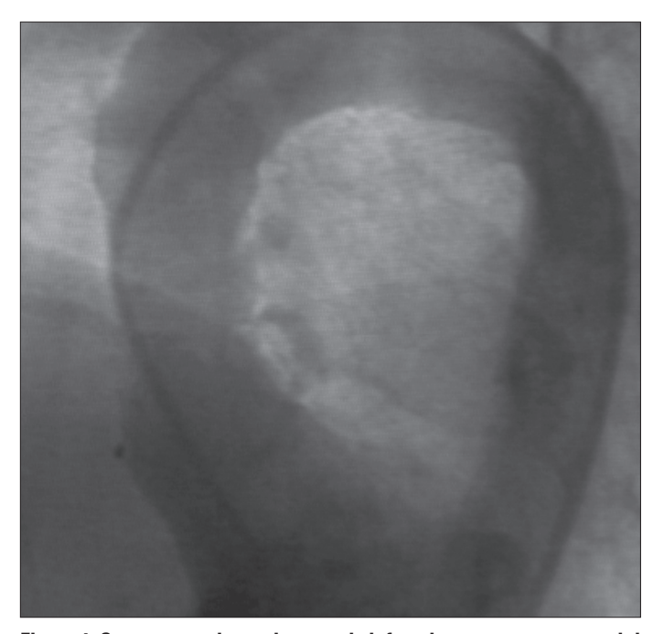
Figure 1. Coronary angiography reveals left main coronary artery ostial stenosis and irregularity of the ascending aorta