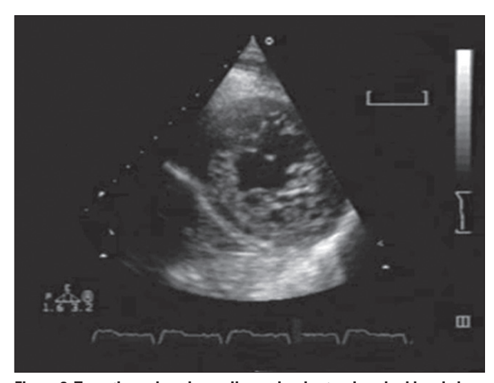
Figure 2. Transthoracic echocardiography short-axis apical level view of trabeculation of antero-lateral and infero-posterior walls

vessels, with nonspecific disarray. MRI study confirmed BVNCM (Fig. 3), showing: the mild dilatation and global hypokinesia of ventricles, the existence of abnormal inner zones of noncompaction, mainly located in LV (apical-mid-lateral wall and interventricular septum juxta-apex) and right ventricle (anterior wall and apex).