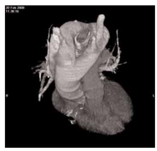
Figure 2. 3-dimensional reconstruction tomographic image of double aortic arch

Hatice Nursun Özcan, Fırat Özcan<sup>1</sup>, Deniz Adıgüzel, Selim Ardıç Department of Radiology, Numune Education and Research Hospital Ankara