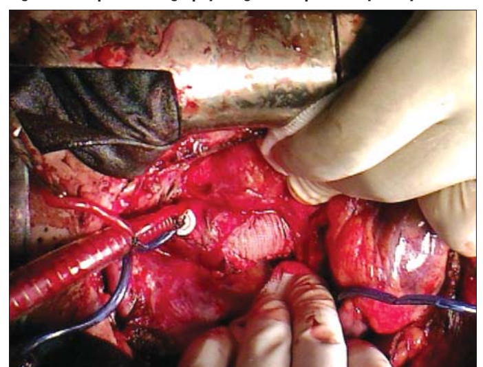
Figure 4. Doty's procedure