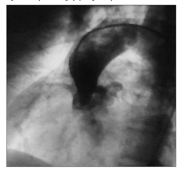
Figure 2. Aortography image showing supravalvular aortic stenosis

well-known technique, which involves an inverted Y patch for the first time with success. When the stenosis is very close to the valves and the coronary ostia, the use of the Doty technique may be preferred (7). There are several variations of the surgical technique for correcting this type of defect. In a study concerning the efficacy of several techniques, Hazekamp et al., did not find any significant differences in change in valve function, and found the efficacy of reducing the pressure gradient was similar and acceptable in all techniques (8). In the cases of recurrent serious stenosis, an alternative is to use a valved conduit between the free wall of aortic root and the stenosis free aorta (3). Similarly, autologous arterial graft from the pulmonary artery, as described by Al-Halees et al, can be used as another option not only for cases of recurring stenosis but also for complex cases with diffuse stenosis (9).