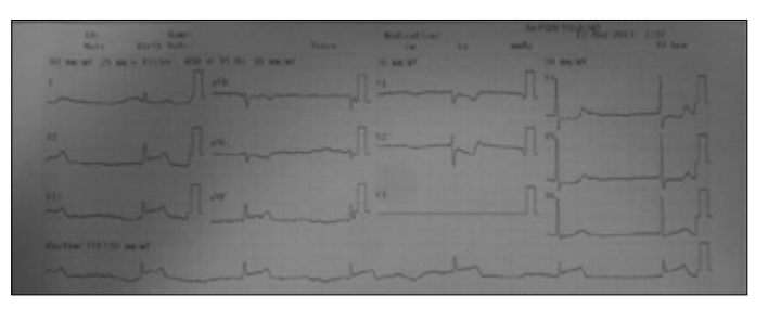
Figure 1. ST elevation in inferior leads on 12-derivation ECG obtained in the emergency department