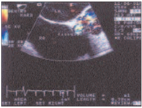
Figure 1: Transesophageal echocardiographic color Doppler imaging of aortoright atrial fistula.

Dokuz Eylül University, School of Medicine, Department of Cardiology, Izmir, Turkey