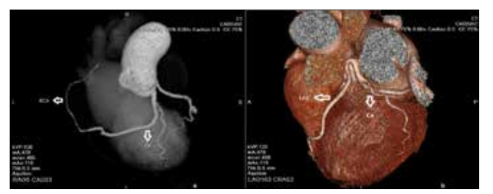
Figure 2. Multidetector computed tomography (64-slice) views of single coronary artery

Cx - circumflex artery, LAD - left anterior descending artery RCA - right coronary artery