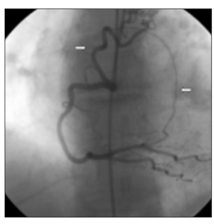
Figure 2. Two coronary fistulas originated from the proximal and distal portion of the right coronary artery (RCA) are seen on coronary angiography (arrows). The fistula arose from the proximal RCA drains in to the pulmonary artery like fistulas seen in Figure 1