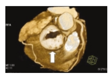
Figure 3. Multislice computed tomography demonstrates a giant aneurysm strongly suspected to be originated from right coronary artery. A three dimensional reconstruction (using volume rendering techniques or VRT) shows the lumen of the aneurysm incompletely filled with mural thrombus.