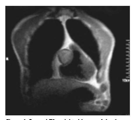
Figure 4. Coronal T2-weighted image of the thorax demonstrates the large spherical mass

subsequent vessel occlusion, distal thromboembolization or even myocardial infarction (4). The aneurysm may also present as an intracardiac mass once it is thrombosed (5). New imaging techniques as MSCT and MRI are going to be well-established and widely used methods to evaluate such abnormalities nowadays.