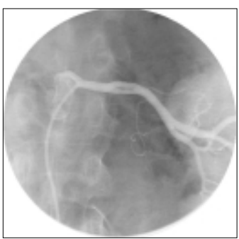
Figures 1 and 2. Selective left renal angiography views showing fenestration

Since we did not perform renal vein renin analysis, we cannot comment on whether hypertension which was poorly controlled with combined antihypertensive medications can be associated with this anomaly.