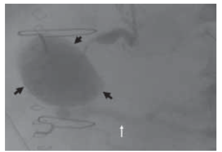
Figure 2. Right coronary angiogram showing a saccular aneurysm (black arrows) of right coronary artery (white arrow)

last nine cases early diagnosis and surgical treatment was possible. Treatment of a mycotic coronary artery aneurysm includes appropriate antibiotic treatment and prompt surgical intervention (1).