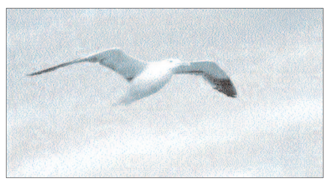
Alkatras Adası'ndan, USA