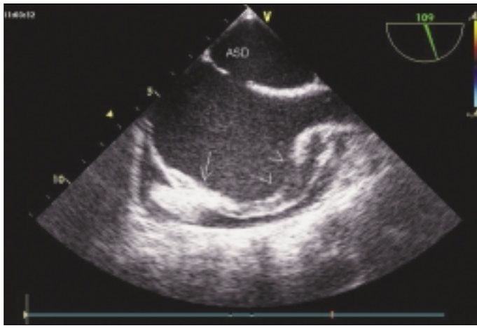
Figure 1. Dissection in the right atrial wall (arrow head) and thrombus (arrow) with pericardial effusion demonstrated by transesophageal bicaval view

Right atrial dissection and rupture, unusual complications of a cardiac catheterization, occurred in 54 years old woman with atrial septal defect illustrated here by live three-dimensional transthoracic echocardiography. The patient was admitted to our hospital for evaluation of the interatrial septum for transcatheter device closure. She had underwent cardiac catheterization and coronary angiography two months ago. She had been complaining of well tolerated exertional dyspnea for three years. After the cardiac catheterization, she has had no any new complaint. Her blood test results were as following: red blood cell count was 11.9x1012/L, 11.0x1012/L and hematocrit was 38%, 37% before and after the cardiac catheterization, respectively. 2D-transthoracic echocardiography demonstrated minimal pericardial effusion, localized only behind the posterior