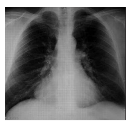
Figure 1. Chest X-ray image of a mass at the right cardiophrenic sinus

The patient underwent operation. Following median sternotomy, the mass was explored. It was a cystic structure, filled with clear yellow fluid and attached to the right side of the pericardium with a generous fat pad.