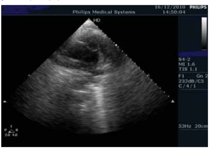
Figure 4. Transesophageal echocardiography view of a pulmonary artery cyst

gradient (25 mmHg) over the pulmonary artery cyst (Fig. 2). Transesophageal echocardiography examination was also confirmed a pulmonary artery cyst over the pulmonary valve (Fig. 3, 4). She was referred to a cardiovascular surgeon. After the proper preparation for surgery, the patient was operated and the cystic material was excision. Pathological examination showed that the cyst was echinococcal (hydatid). Post-surgical antiparasite chemotherapy, based on albendazole, was prescribed for the patient.