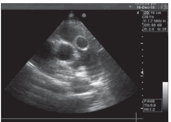
Figure 1. Short- axis echocardiography view of pulmonary artery cyst at the level of the pulmonary valve

A 33-year-old woman was admitted to our clinic with dyspnea, fatigue and palpitation, which had started for 1 month before admission. She had a history of migraine. On physical examination, there was a grade 3 midsystolic murmur over the left second intercostal space. Electrocardiography and chest radiography were normal. Two-dimensional transthoracic echocardiography short-axis views showed a pulmonary artery cyst (Fig. 1, Video 1. See corresponding video/movie images at www.anakarder.com). The cyst was well-demarcated and unilocular. The cyst wall was thickened and regular. Examination with continuous wave Doppler showed that there was a considerable mean