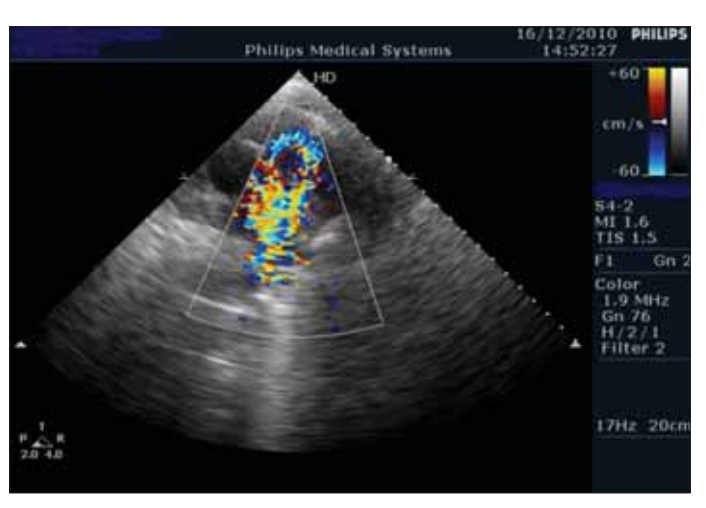
Figure 3. Transesophageal echocardiography color Doppler image of a pulmonary artery cyst