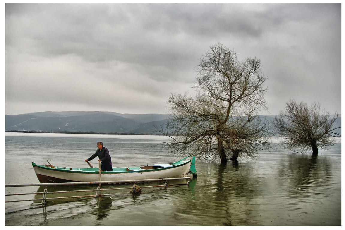
Ayla Bağ, from EFSAD's collections.

27. Rosenstock J, Hansen L, Zee P, Li Y, Cook W, Hirshberg B, et al. Dual add-on therapy in type 2 diabetes poorly controlled with metformin monotherapy: a randomized double-blind trial of saxagliptin plus dapagliflozin addition versus single addition of saxagliptin or dapagliflozin to metformin. Diabetes Care 2015; 38: 376-83. [CrossRef]