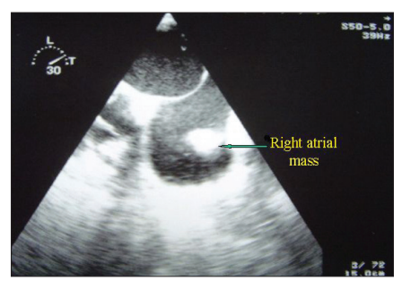
Figure 1. Echocardiographic view of right atrial mass

A 67-year-old female patient was referred to our clinic with increasing shortness of breath on exertion. The past medical history was unremarkable, except for obesity (weight, 90 kg) and atrial fibrillation. She was hemodynamically stable and her physical examination was normal. The echocardiographic examination revealed an ascending aortic aneurysm (AAA) with a diameter of 5.5 cm and a finger-like right atrial mass, suggestive of a right atrial tumor (Fig. 1).