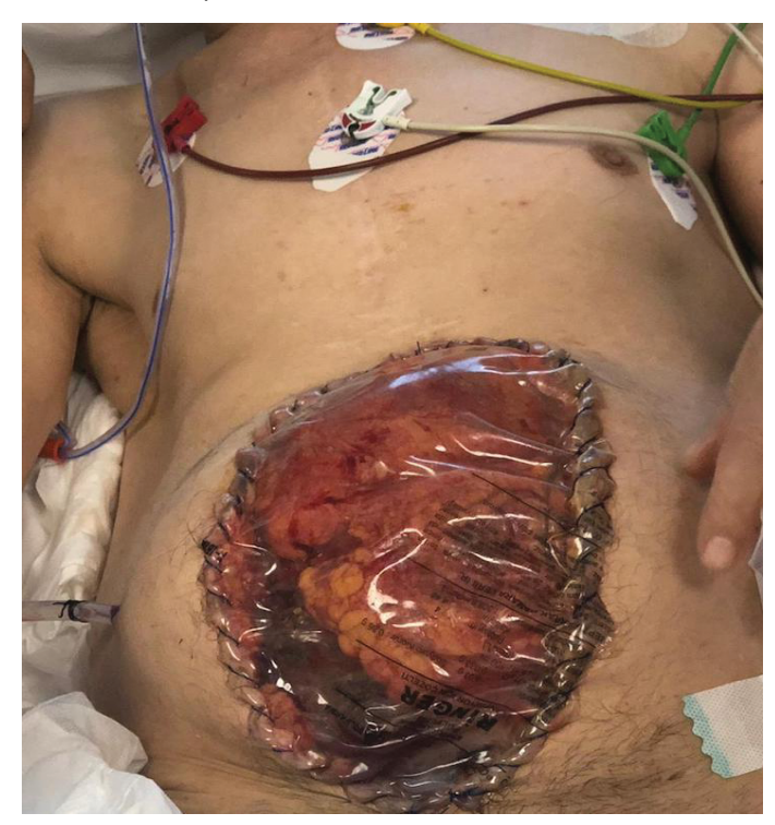
Figure 2. Appearance of the abdomen after surgical decompression

follow-up was advised after gastroenterology—surgery consultation. Six hours later, anuria developed, and intravesical measurement of intraabdominal pressure showed a value of 26 mm Hg; thus, ACoS diagnosis was confirmed. The patient underwent surgical decompression (Fig. 2), following which urine output was restored and renal function tests returned to normal values in 2 days. The Hb level was normalized in the following days. Patient's skin was closed 4 days postoperatively. Anticoagulation