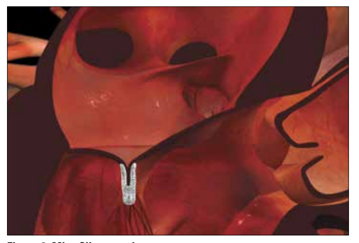
Figure 2. MitraClip procedure

The 30-day procedure related mortality rate was similar in both the groups (7.7% in the HRS vs 8.3% in the comparator group). The 12-month survival was higher in the HRS group