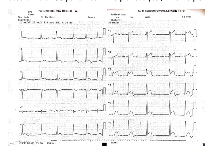
Figure 1. ECG shows atrial fibrillation. ST elevations are most prominent in V3, which also has a notch on the descending part of QRS compatible with early repolarization

In addition, the ECG presented in Figure 1 shows classic type 2 Brugada pattern and, ST elevation on V1 and V2, which were absent in the ECG performed in the previous year, which is pre-