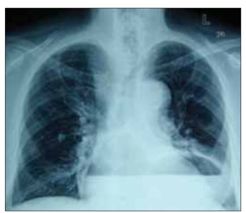
Figure 1. Posterior-anterior chest X-ray view of a large focal airspace process within the heart silhouette

The diagnosis was a large hiatus hernia with intrathoracic stomach as confirmed by lateral chest X-ray (Fig. 4). Hiatal hernias are common,