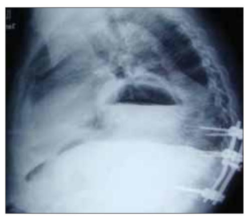
Figure 4. Lateral chest X-ray view of a large focal airspace process in hemithorax

and are usually asymptomatic. Symptoms of hiatal hernia can be vague, including postprandial distress, fullness, dysphagia, nausea, vomiting, reflux and chronic anemia due to mucosal blood loss. Additionally, severe cases may present with respiratory failure in elderly patients. The therapeutic strategy of surgical repair is recommended in elderly patients with hiatus hernia complicated with respiratory impairment.