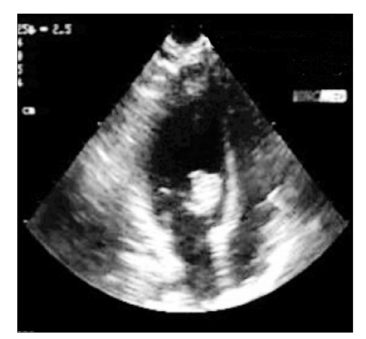
Figure 1. Transthoracic echocardiography shows a homogeneous and hyperechogenic mass in the left ventricle (mimicking myxoma), under the anterior leaflet of the mitral valve, without signs of obstruction

Cardiac hydatid cyst is uncommon complication of hydatid disease. Because contractions of the heart provide a natural resistance to the presence of viable hydatid cysts, primary echinococcosis of the heart is rare (5). Diagnosis of cardiac hydatid cyst is easy with typical cystic appearance in echocardiography;