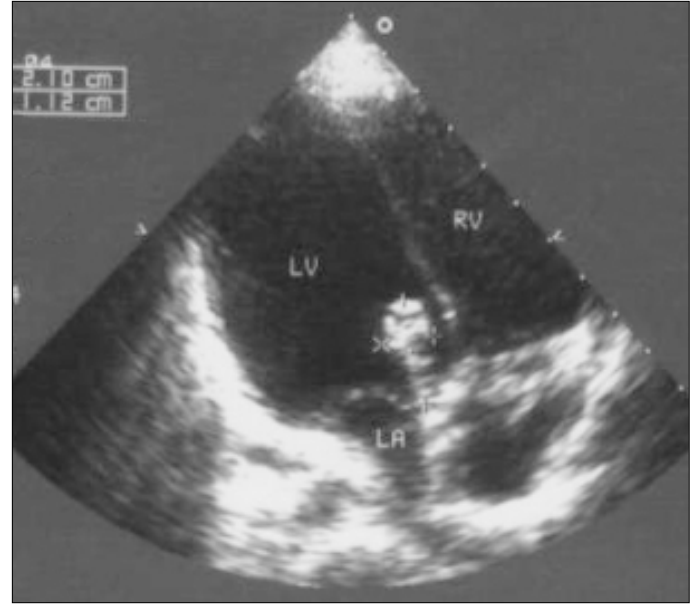
Figure 3. Transthoracic echocardiography three years after the operation. A hyperechogenic recurrent mass is seen in the previous localization

Cardiac hydatid cysts can cause life-threatening complications such as cerebral embolism, cardiac failure, and cyst rupture, and thus the establishment of an early diagnosis and the performance of a timely, potentially curative, surgical intervention are of paramount importance (7). Surgery has been proven the best treatment for hydatid cyst of the heart.