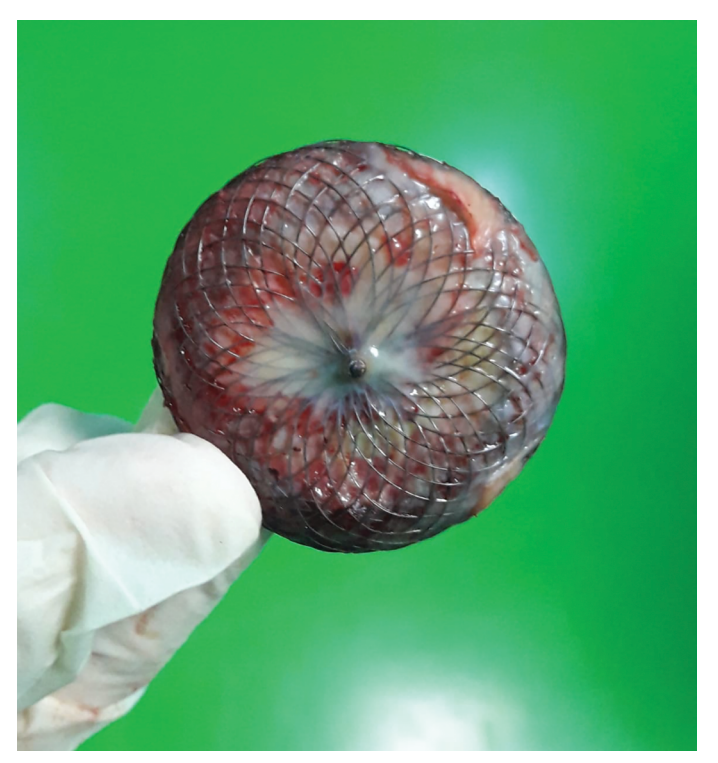
Figure 5. After surgical removal, the device was macroscopically intact

The most preferred treatment in any clinical situation is the surgical closure of ASD. An alternative to surgical closure of ASD is percutaneous closure, which is associated with