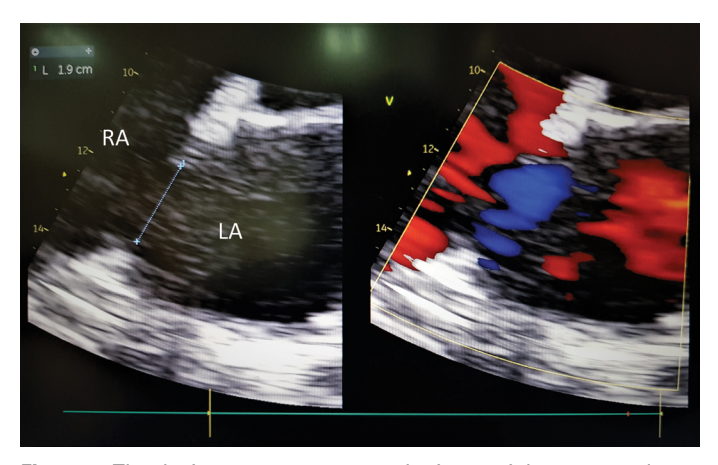
Figure 1. The device was not seen on the interatrial septum and was thought to be embolized

A 47-year-old male patient underwent successful transcatheter ASD closure with the 30-mm Amplatzer septal occluder device on January 24, 2012, due to secundum ASD. He did not have any residual shunt, and no problem was detected on echocardiography during the first 4 postoperative years. When the report of the last echocardiography performed in 2017 was examined, the interatrial septum was observed to be intact. When control transthoracic echocardiography was performed on December 20, 2018, 7 years after percutaneous ASD closure, shunt flow from the left atrium to the right atrium was detected. The device was not seen in the interatrial septum and was thought to be embolized (Fig. 1).