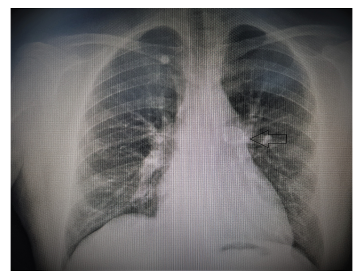
Figure 3. Pulmonary posteroanterior radiography showed the ASD occluder device