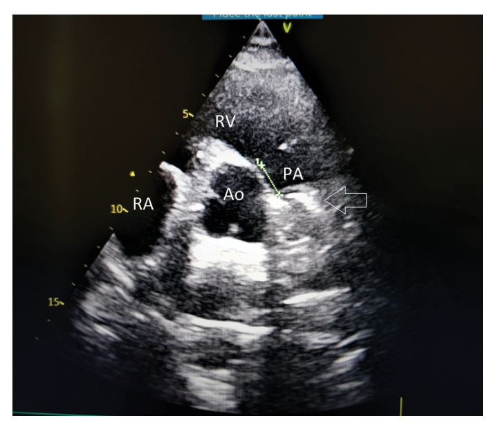
Figure 2. An ASD occluder was observed 2 cm above the pulmonary valve

The patient had no symptoms, such as dyspnea or chest discomfort, associated with the dislocation of the ASD occluder device. Coronary angiography and right heart catheterization were performed, and the coronary arteries were normal. In addition, the appearance of the occluder during coronary angiography was observed in the main pulmonary artery (Fig. 4).