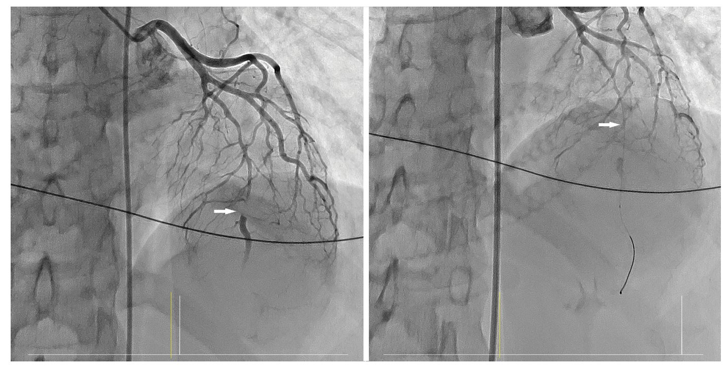
Figure 1. Coronary angiography in the anterior-posterior cranial view showing subocclusion of the left anterior descending coronary artery with TIMI 1 flow (arrow, left panel). No-reflow after wiring the left anterior descending coronary artery (right panel)