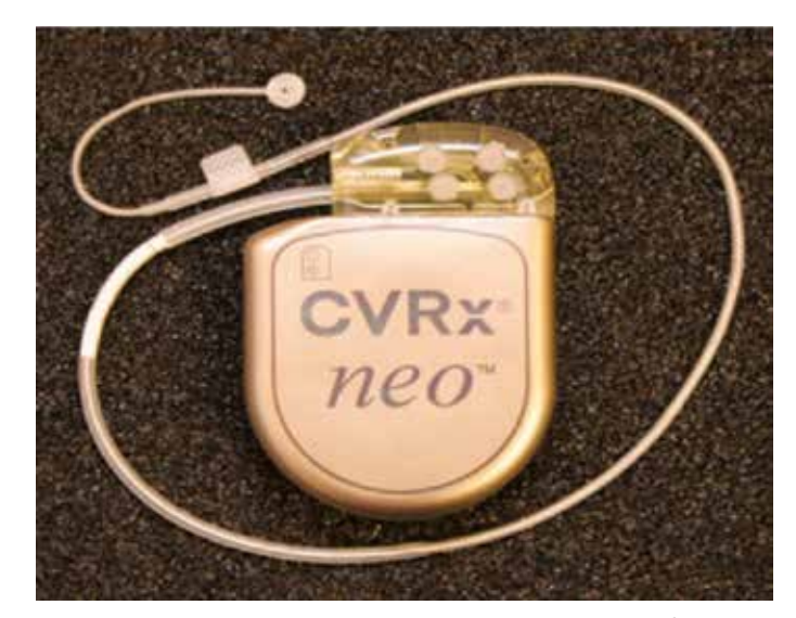
Figure 2. Carotid sinus nerve stimulation therapy system (Barostim neo<sup>™</sup> System, CVRx Inc., Minneapolis, MN, USA)

Clinical evidence from the Autonomic Tone and Reflexes after Myocardial Infarction study (25) and the Cardiac Insufficiency Bisoprolol Study II (26) indicates that diminished cardiac vagal activity and increased heart rate predict a high mortality rate in congestive heart failure. Therefore, modulation of the ANS (neuromodulation) with the aim of restoring a more normal