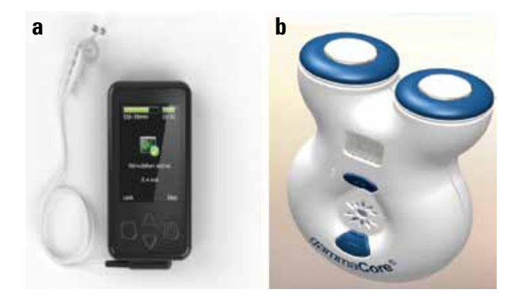
Figure 3. Non-implantable vagus nerve stimulation systems: (a) NEMOS® (transcutaneous vagus nerve stimulation; Cerbomed, Erlangen, Germany), (b) gammaCore (noninvasive vagus nerve stimulation; ElectroCore, Basking Ridge, NJ, USA)

As noted earlier, different levels of parasympathetic stimulation exert different anti-arrhythmic effects. Thus, it has been