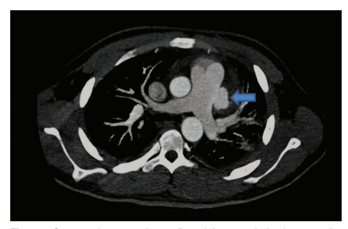
Figure 3. Computed tomography confirmed the association between the pseudoaneurysm (arrow) and the main pulmonary artery

Address for Correspondence: Li Rao, PHD West China Hospital of Sichuan University 37 Guo Xue Xiang, Chengdu Sichuan 610041- China