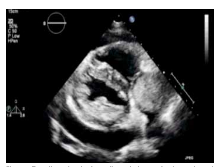
Figure 1. Two-dimensional echocardiography image of a giant and round thrombi in the right atrium

Thrombosis is a possible complication of central venous catheters utilized for hemodialysis. We report the case of a 25-year-old man with a previous chronic vascular hemodialysis catheter who was referred for routine echocardiogram due to persistent fewer. The rest of the physical examination was unremarkable. Electrocardiography showed normal sinus rhythm. We demonstrated the presence of a 37x36 mm rounded mass and pending of the free wall of the right atrium with normal ejection fraction [Video 1, Fig. 1 (2D images), Video 2, Fig. 2 (3-dimensional echocardiography images). See corresponding video/movie images at www.anakarder.com]. Transesophageal study confirmed the giant