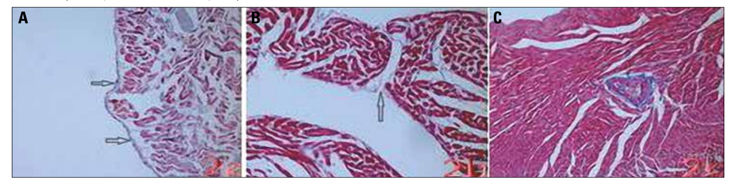
Figure 2 A-C. RT group heart tissue. Radiation caused fibrosis in ventricule (A), atrium (B) and aorta/cardiac vessels (C) (arrows, Masson's trichrome, x200)

The factors which result in cardiotoxicity as an adjuvant therapy can be classified based on the use of RT, use of chemotherapy regimens including anthracyclines or trastuzumab and the characteristics of the patient (6, 15-17). Cardiovascular complication related to RT is undeniable. Radiotherapy may lead to increased atherosclerosis, peri- and myocardial fibrosis and heart valve diseases. Factors leading to cardiac complications and increased severity include radiated side, radiated cardiac volume, radiation energy, fractionation, total radiation dose, concomitant chemotherapy administration and the age of the patient. Although cardiovascular morbidity and mortality have been reduced in the patients who underwent RT, selecting the