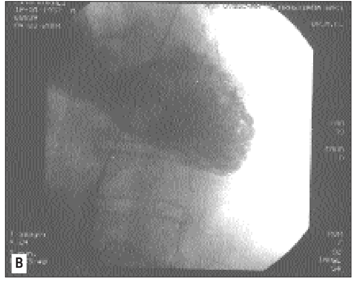
Figure 1. Left ventriculography view of loosened, spongy myocardium, with deep intramyocardial recesses and prominent trabeculations during systole (A) and during diastole (B)