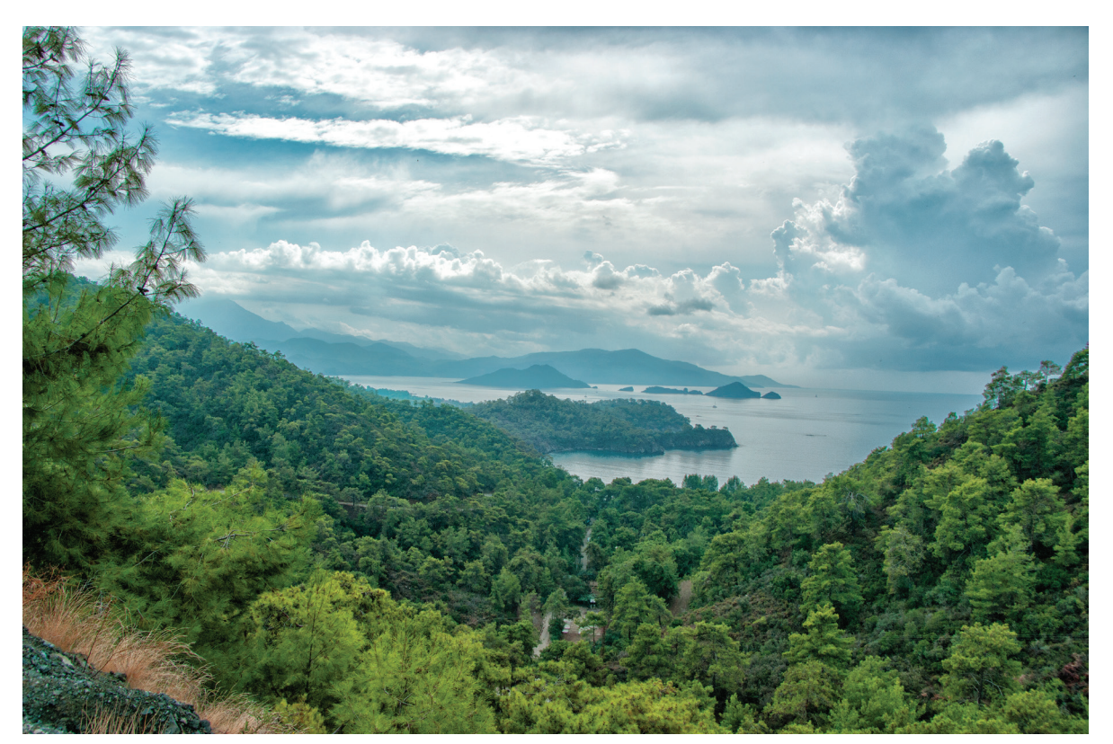
Ayla Bağ, from EFSAD's collections.