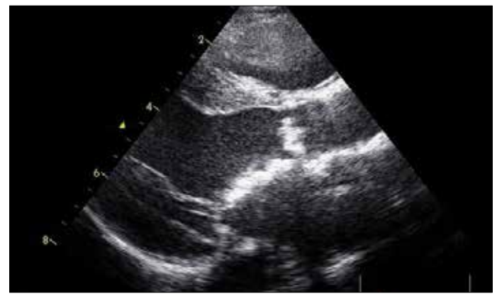
Figure 1. In the parasternal long axis cross-section, anterior mitral valve leaflet, the aortic annulus, and the endocardium layer were thick and hyperechogenic

A 9-year-old girl was admitted to our outpatient with complaints of syncope following exertion. The patient had a history of six glaucoma surgeries. Echocardiography identified a thick anterior mitral valve leaflet with hyperechogenicity. A diastolic gradient with a maximum of 10 mm Hg and an average of 4.6 mm Hg was measured between the left atrium-left ventricle, which demonstrated restricted movement (Video 1. See corresponding video/movie images at www.anakarder.com). In the parasternal short-axis cross-section, aortic valve cusps were observed as being thick and hyperechogenic with restricted movement (Video 2. See corresponding video/movie images at www.anakarder. com). A thick, calcific, hyperechogenic abnormal chord structure was observed on the outflow tract of the left ventricle, extending to the outflow tract of the mitral posterolateral leaflet chord. Color Doppler examination revealed turbulent aortic flow. With CW Doppler, a systolic gradient of a maximum of 123 mm Hg, with average of 67 mm Hg, was identified between the left ventricle and aorta. It was observed that the mitral valve anterior leaflet, the aortic annulus, and the endo-