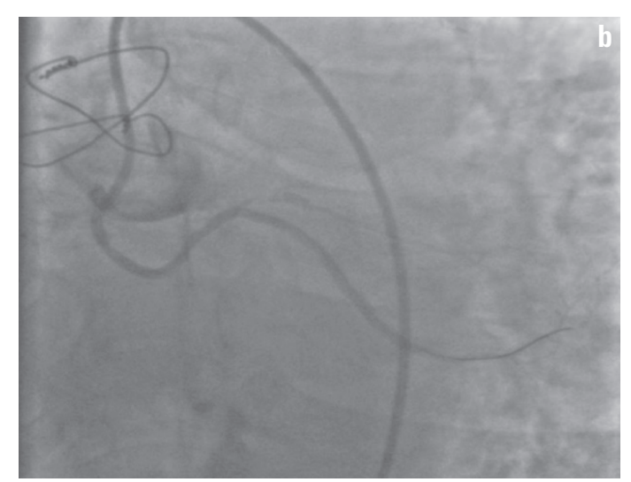
Figure 2. (a) Circumflex (CX) coronary artery. Overall, 90% stenosis in the middle portion was observed. (b) CX coronary artery completely opened after stent implantation