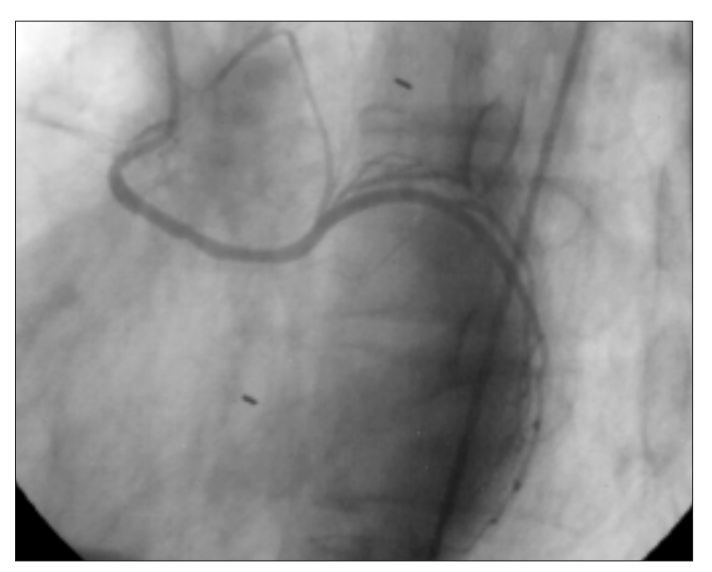
Figure 3. Circumflex artery was selectively catheterized from the right coronary sinus