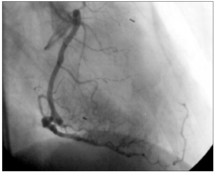
Figure 2. Selective right coronary injection indicated normal right coronary artery, but visualized distal left descending coronary artery