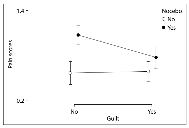
Figure 1. Pain ratings as a function of nocebo and guilt condition.

To test whether non-physical nocebo induction had an effect on pain ratings, an independent t-test was conducted on nocebo and no nocebo conditions of pain ratings. It was found that pain ratings were