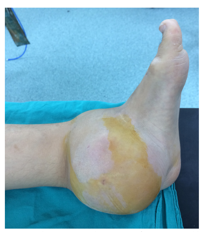
Figure 1. Chronic septic arthritic image of sixteen years old patient.

The older sister diagnosis was made in infancy period while being investigated for fever etiology. Her medical history revealed episodic increase in body temperature, self-harming behaviours, recurrent surgical procedure from knees, hands, fingers and heels in ortopedia clinics due to traumatic and none traumatic reasons. Moderate mental retardation diagnosis had been made by pediatric psychiatry. Physical examination revealed, retardation in mental function, dry skin, thickening of the palms of both hands,