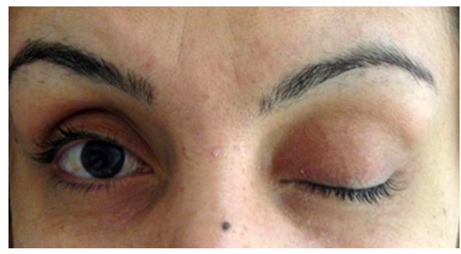
Figure 1. Complete oculomotor nerve palsy before the intervention.

Both sides of the head and neck experienced pain. She had no history of headache. Visual analog scale (VAS) score was 10. She had previously presented to the emergency department three times during this period with severe headache, but was discharged after limited relief. There was no apparent response to parenteral or oral NSAIDs. Cranial tomography was also performed, and the findings were normal. She could not sleep during nights because of this headache. She realized a drop in her left eyelid in her last emergency department presentation (Fig. 1). She was alert, oriented, and appropriate. There was no nuchal rigidity. Neurological examination revealed complete oculomotor nerve palsy on the left side. Computed tomography (CT) findings were normal. Brain MRI and and intracranial cerebral MRI angiography revealed saccular aneurysm of the Posterior Communicating Artery, with two associated daughter aneurysms. Balloon-assisted endovascular coil embolization of the aneurysm was performed under DSA (Fig. 2a, b). No evidence of diffuse segmental intracerebral arterial vasoconstriction was observed