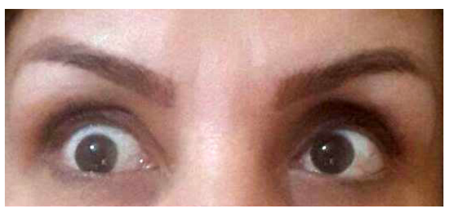
Figure 3. Resolution of the oculomotor nerve palsy 3 months after the intervention.

during DSA. After endovascular intervention, TCH spontaneously resolved. The patient was discharged on the third day of endovascular intervention with oral steroids and 100 mg aspirin. Complete oculomotor nerve palsy recovered with mild ptosis in 3 months (Fig. 3). At the 1-year follow up, she had no subjective symptoms.