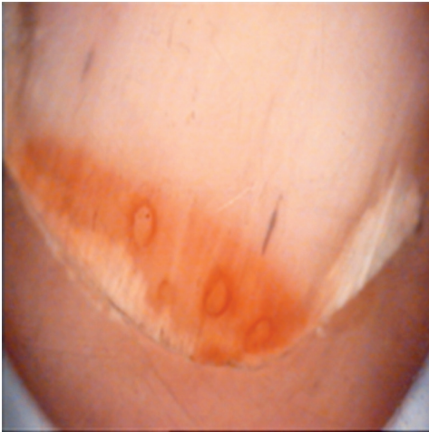
Figure 1. Pitting on nail with henna, splinter haemorrhage, distal-lateral onycholysis

Dermoscopy can be useful in the evaluation of psoriatic nail when there are no typical clinical features. Dermoscopic findings vary depending on the affected area of the nail. Dermoscopy allows for a more detailed and easy evaluation of superficial abnormalities associated with nail matrix involvement such as pitting and crumbling and findings associated with nail bed involvement e.g. onycholysis, oil spots, subungual hyperkeratosis and splinter haemorrhages 5,6 .